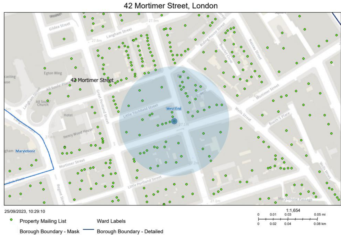
Resident Count = 84